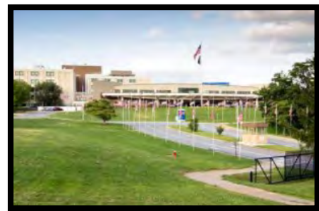
Charles George VA Medical Center Asheville, NC

Buddy Baskets—household cleaning supplies, broom, laundry basket, paper towels, toilet paper