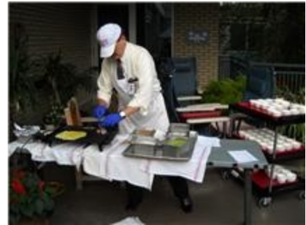
Right: The VA's omelet expert at work.