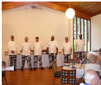
VRQ Culinary Commando Team